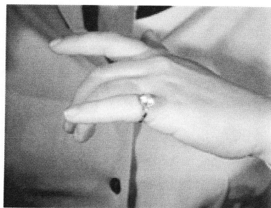
Fig. 18 Laurie's fingers