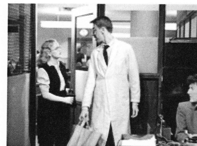
Fig. 10. Disguises 6: Armour Employees: "I've got a girlfriend who works in the front-office."