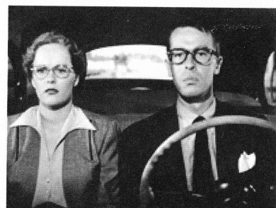
Fig. 8 Disguises 4: Nice, Young Couple