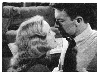
Fig. 16 Finally face to face. "I'll do anything."