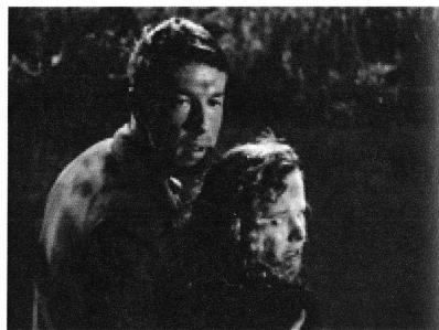
Fig. 34 Looking Back at the Look Forward