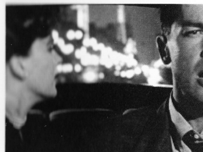
Fig. 31 Hampton in Reverse