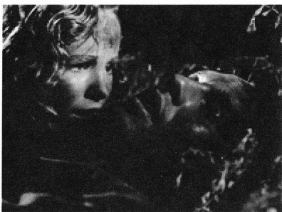
Fig. 35 Face to Face, Mouth to Mouth