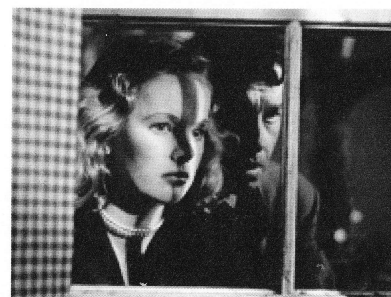
Fig. 32 At Ruby's Window