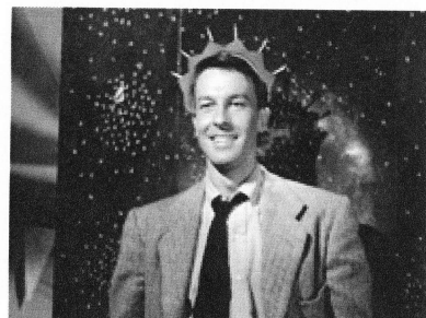
Fig. 6 Disguises 2: Gun King Bart