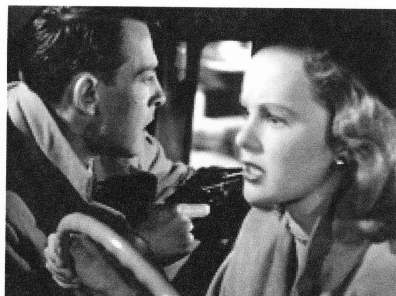
Fig. 21 Hampton, Cross-purposes: "Shoot!"