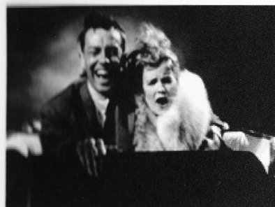
Fig. 29 Les Vampires, Night