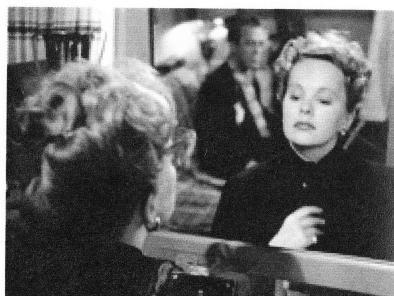
Fig. 24 The Woman in the Mirror 1