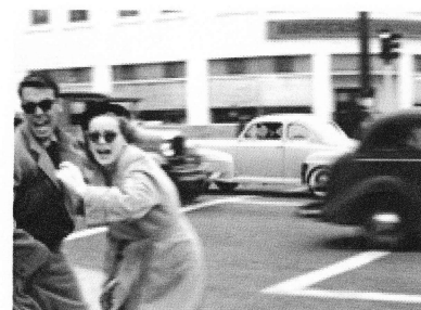
Fig. 14 Les Vampires, day