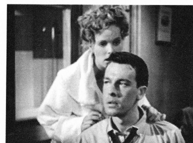
Fig. 12 The Voice in Bart's Ear 1: "When are you going to begin to live?"