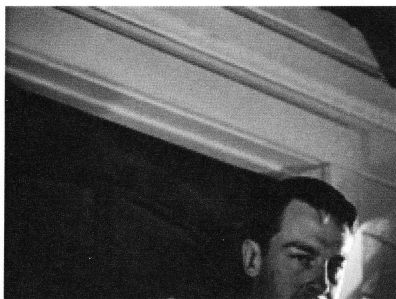
Fig. 33 Bart Descending