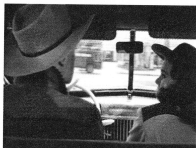
Fig. 7 Disguises 3: Work clothes