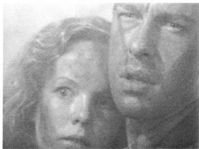
Fig. 36 Waking Dream