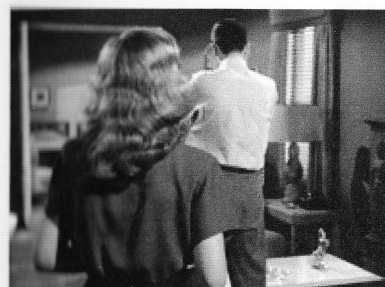
Fig. 15 The Voice in Bart's Ear 3: "I can just kill."