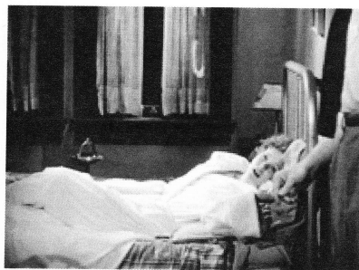
Fig. 17 Bart's Hand