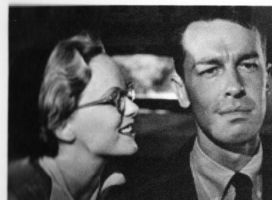
Fig. 13 The Voice in Bart's Ear 2: "I love you," followed by burglar alarm.