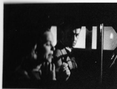
Fig. 25 The Woman in the Mirror 2