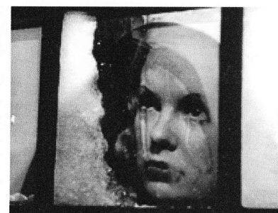
Fig. 26 The Woman in the Window 1