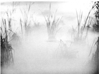
Fig. 37 Sunrise, Dreamscape