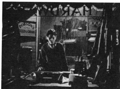
Fig. 19 The Other Side of the Screen 1: Behind the Cracked Window