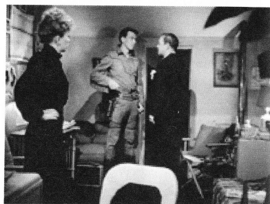
Fig. 20 The Other Side of the Screen 2: Behind the Cracked Mirror