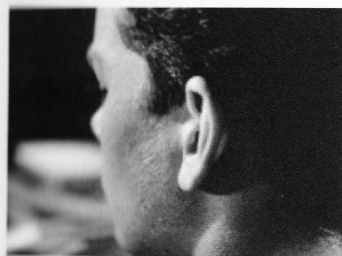
Fig. 11 Bart's Ear