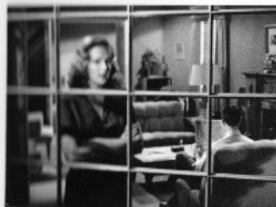
Fig. 27 The Woman in the Window 2