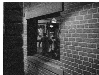
Fig. 30 Window and Mirror, "Death at Work"