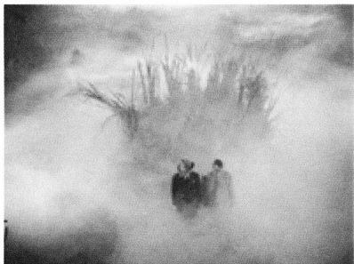
Fig. 38 The False World