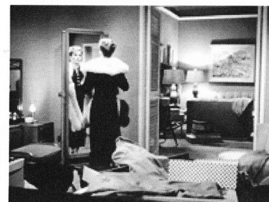
Fig. 28 The Woman in the Mirror 3